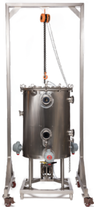
Commercial Ethanol Extractor